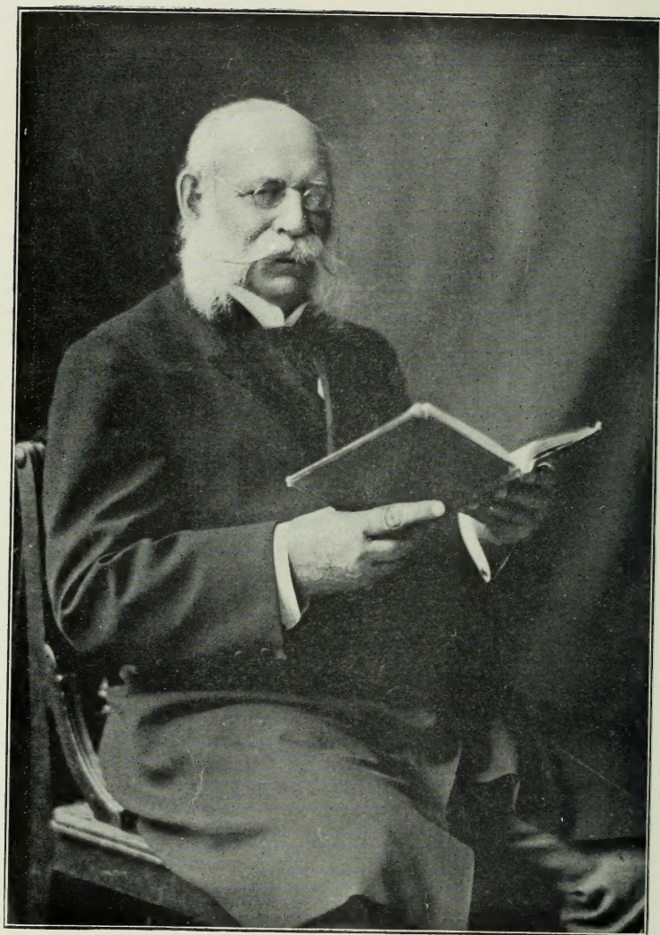
RT. HON. SIR RICHARD CARTWRIGHT